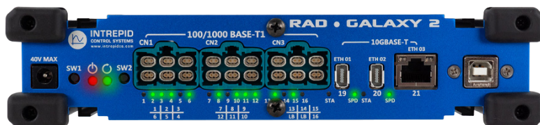
H-MTD Connectors for High-speed 1000BASE-T1 networks